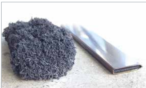
4 mm thick FLEXILODICE P before and after exposure to fire.

Self-adhesive version (ref. SA): FLEXILODICE P can be surfaced with a self-adhesive strip to facilitate installation (specify ref. SA). This method requires the seal to be mounted in order to correctly apply the self adhesive strip on the receiving surface.