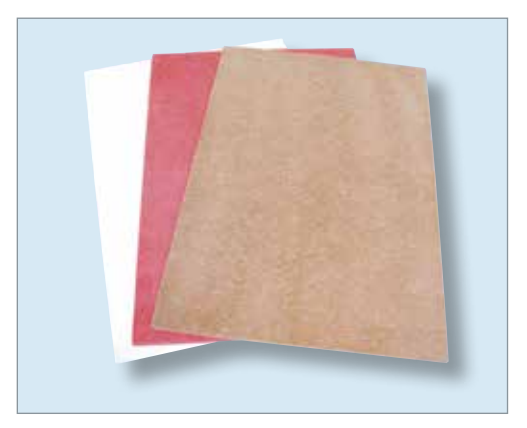
INTERDENS type 15 and type 36.

When exposed to fire, INTERDENS rapidly produces a large quantity of microporous, heat insulating foam, thereby protecting the treated material from fire. It hermetically fits into the gaps formed by distortion and prevents flames, smoke and gases from passing between two construction elements.