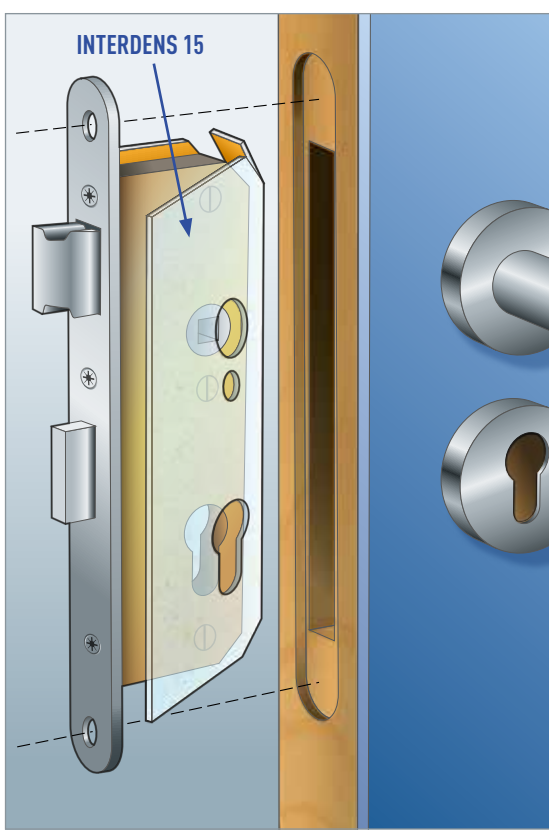
Example of application: protection of a lock casing with INTERDENS 15.

INTERDENS type 36 is used as fire resistant seals placed in grooves in structural components (ex: between the door leaf and the frame or wooden chassis).