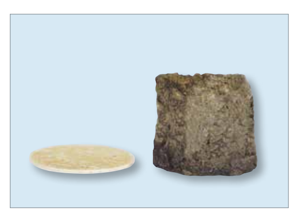
INTERDENS type 36 before and after exposure to fire